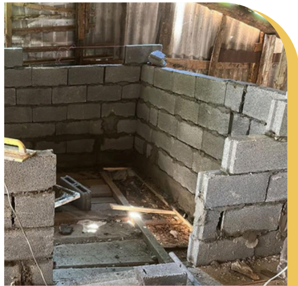
Additional bathroom in the works

The shelter's property was in need of serious renovation, and there were also plans to add a small extension to the rooftop area to improve living conditions for the residents. Thanks to the donation from the Burns Supper Committee, they were able to add two functioning washrooms and create two additional rooms, significantly improving both the comfort of the residents and the shelter's capacity.